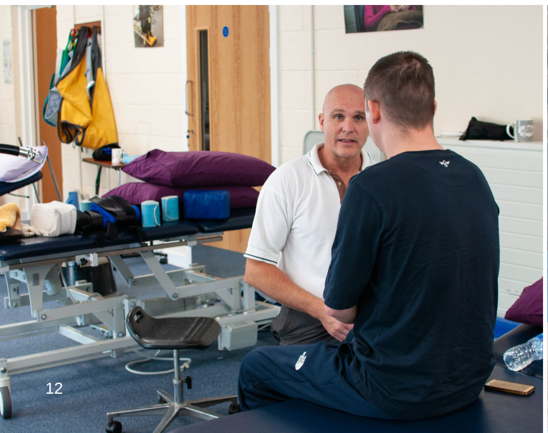
The NMC's specialised gym is the only one of its kind in the UK.

Based in Cheshire, the Centre primarily caters for the North West of England, but the unique provisions and care available, free at point of service, mean that members often travel long distances from all over the UK, and even overseas, highlighting the huge gaps in public service provision for people living with MD and their families and carers.